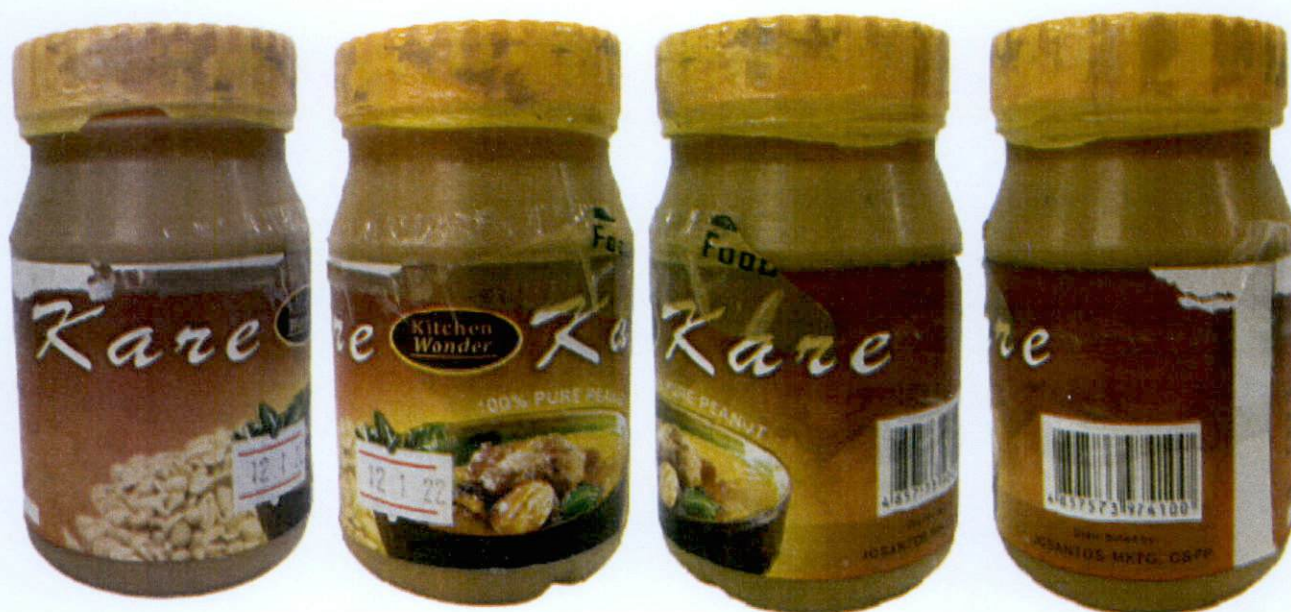
Figure 1. Unregistered KITCHEN WONDER Kare-Kare 100% Pure Peanut

The Food and Drug Administration (FDA) warns all healthcare professionals and the general public NOT TO PURCHASE AND CONSUME the unregistered food product: