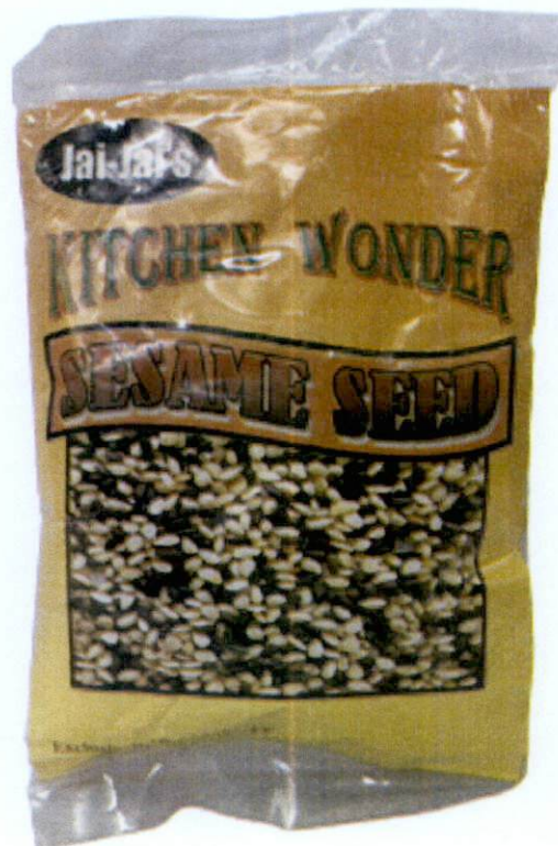
Figure 1. Unregistered JAI-JAI'S KITCHEN WONDER Sesame Seed

The Food and Drug Administration (FDA) warns all healthcare professionals and the general public NOT TO PURCHASE AND CONSUME the unregistered food product: