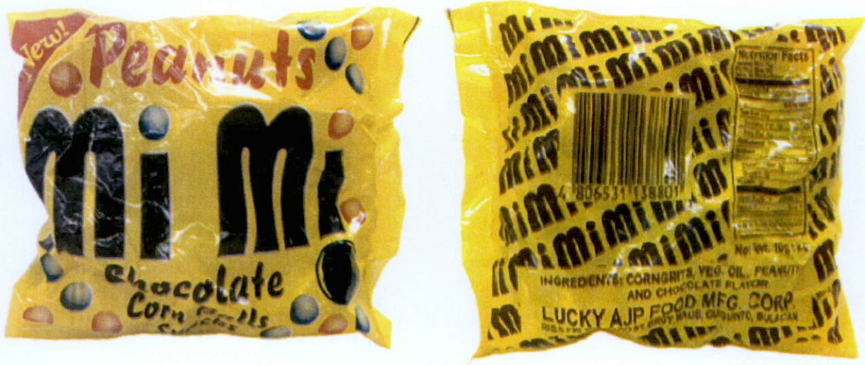
Figure 1. Unregistered PEANUTS MI MI Chocolate Corn Balls Snacks

The Food and Drug Administration (FDA) warns all healthcare professionals and the general public NOT TO PURCHASE AND CONSUME the unregistered food product: