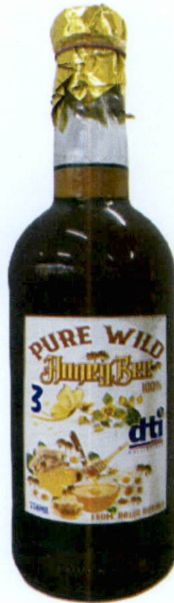
Figure 1. Unregistered PURE WILD Honey Bee 100%

The Food and Drug Administration (FDA) warns all healthcare professionals and the general public NOT TO PURCHASE AND CONSUME the unregistered food product: