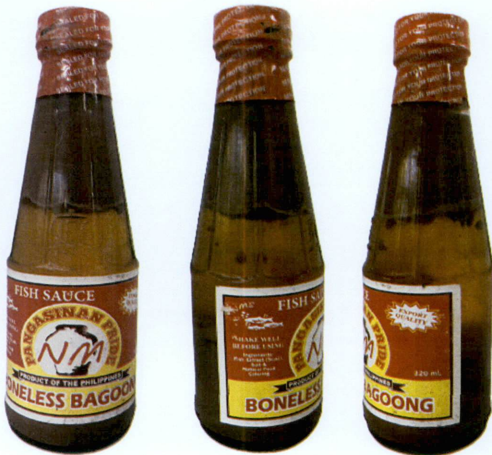
Figure 1. Unregistered NM PANGASINAN PRIDE Fish Sauce Boneless Bagoong

The Food and Drug Administration (FDA) warns all healthcare professionals and the general public NOT TO PURCHASE AND CONSUME the unregistered food product: