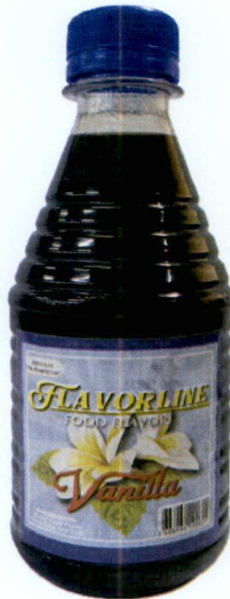
Figure 1. Unregistered FLAVOR LINE Food Flavor Vanilla

The Food and Drug Administration (FDA) warns all healthcare professionals and the general public NOT TO PURCHASE AND CONSUME the unregistered food product: