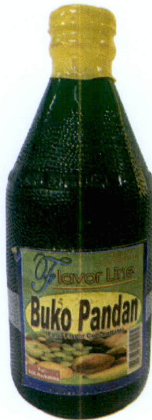
Figure 1. Unregistered FLAVOR LINE Buko Pandan (Food Flavor Concentrate)

The Food and Drug Administration (FDA) warns all healthcare professionals and the general public NOT TO PURCHASE AND CONSUME the unregistered food product: