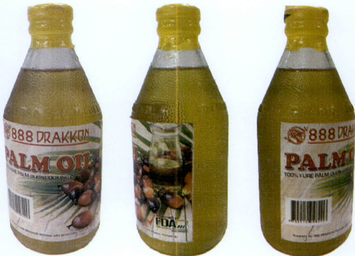
Figure 1. Unregistered 888 DRAKKON Palm Oil 100% Pure Palm Olein Cooking Oil

The Food and Drug Administration (FDA) warns all healthcare professionals and the general public NOT TO PURCHASE AND CONSUME the unregistered food product: