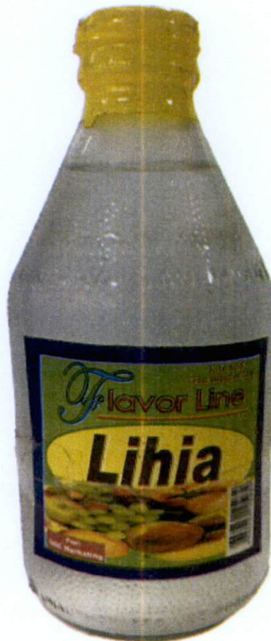
Figure 1. Unregistered FLAVOR LINE Lihia

The Food and Drug Administration (FDA) warns all healthcare professionals and the general public NOT TO PURCHASE AND CONSUME the unregistered food product: