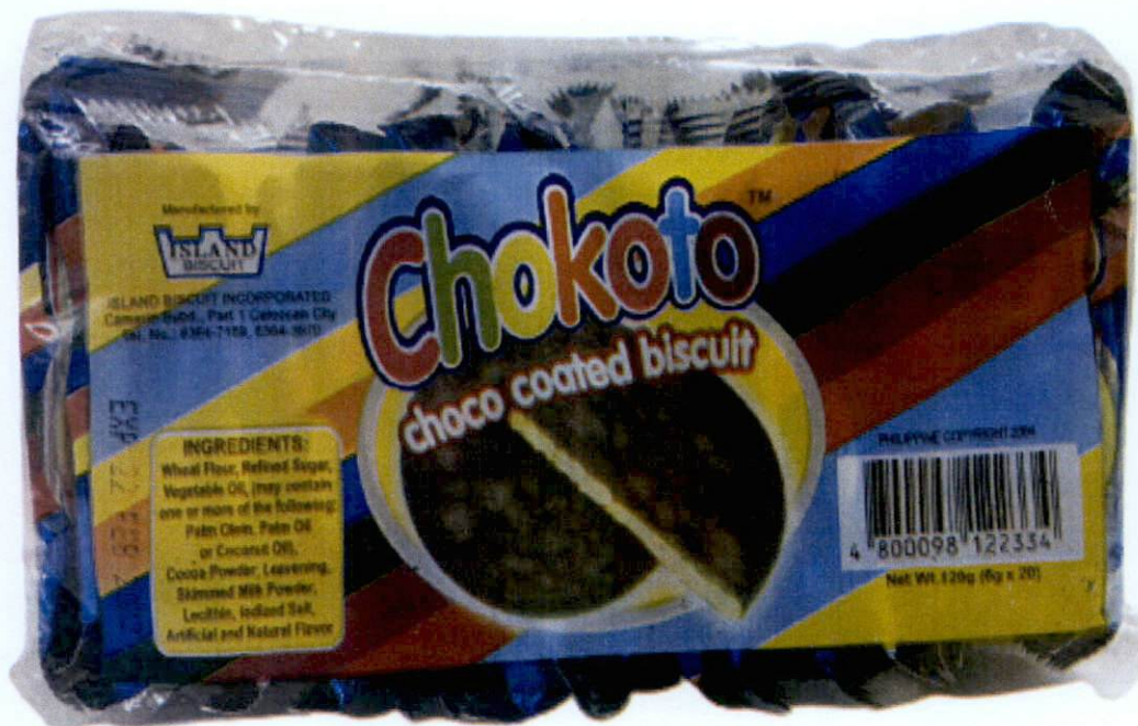
Figure 1. Unregistered CHOKOTO Choco Coated Biscuit

The Food and Drug Administration (FDA) warns all healthcare professionals and the general public NOT TO PURCHASE AND CONSUME the unregistered food product: