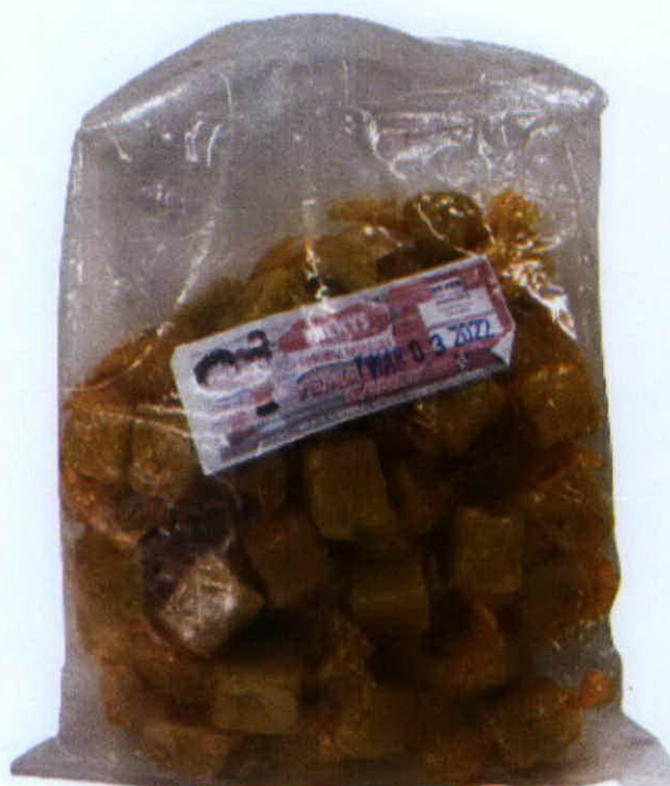
Figure 1. Unregistered MILKYS Yema Candy

The Food and Drug Administration (FDA) warns all healthcare professionals and the general public NOT TO PURCHASE AND CONSUME the unregistered food product: