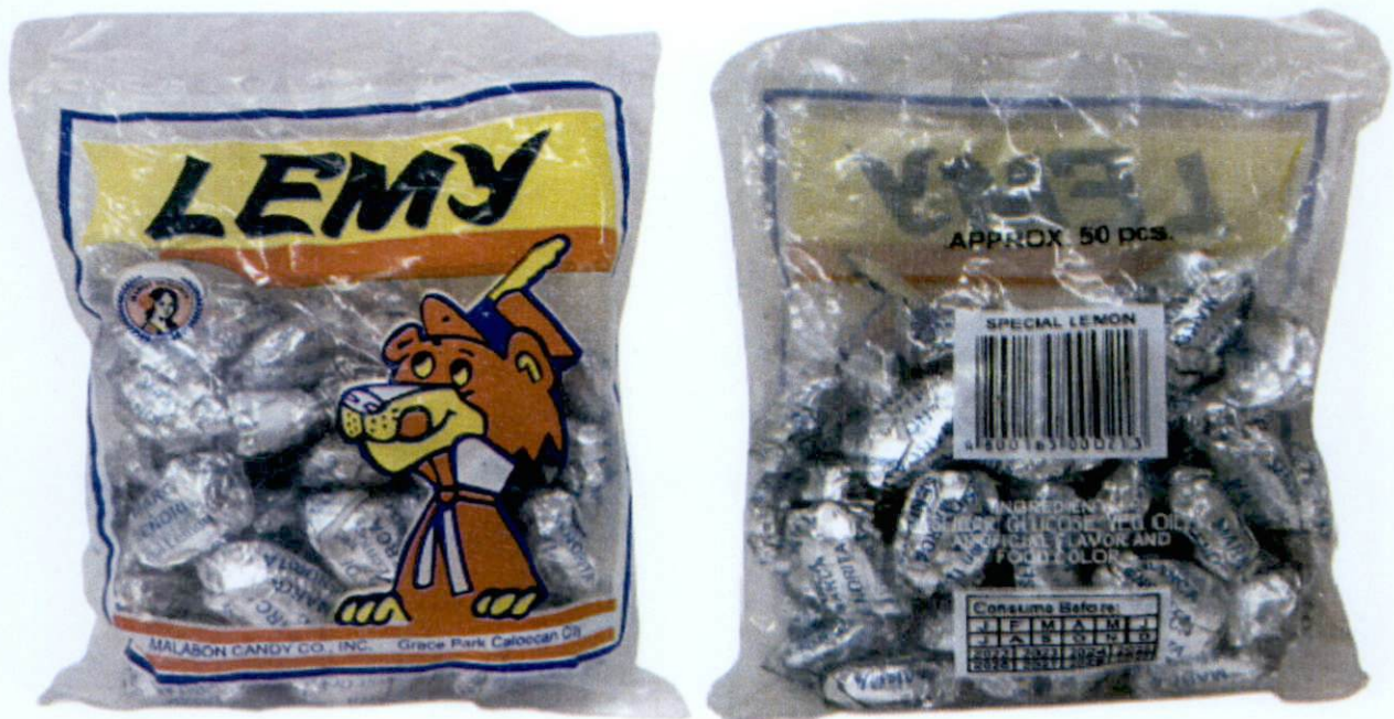
Figure 1. Unregistered MARGA SENORITA Lemy Special Lemon

The Food and Drug Administration (FDA) warns all healthcare professionals and the general public NOT TO PURCHASE AND CONSUME the unregistered food product: