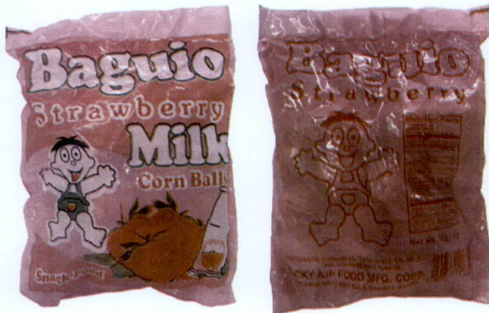
Figure 1. Unregistered BAGUIO STRAWBERRY Milk Corn Balls Snack Food

The Food and Drug Administration (FDA) warns all healthcare professionals and the general public NOT TO PURCHASE AND CONSUME the unregistered food product: