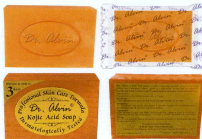
Figure 2. Authentic Professional Skin Care Formula-Dr. Alvin® Kojic Acid Soap is engraved with Dr. Alvin® on the soap and is packed in OPP-CPP Film Pillow wrap with violet prints of Dr. Alvin®; boxed in an individual metallic orange display box with the gold background color for black printed text and Dr. Alvin®.