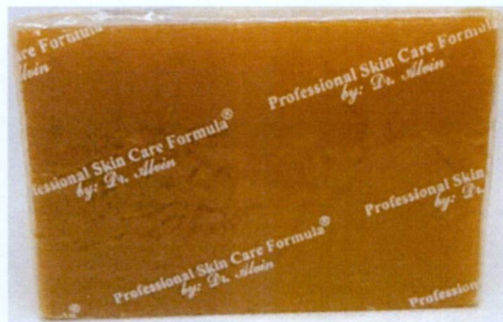
Figure 1. Counterfeit Professional Skin Care Formula by Dr. Alvin

The Food and Drug Administration (FDA) warns the public from purchasing and using the below counterfeit cosmetic product: