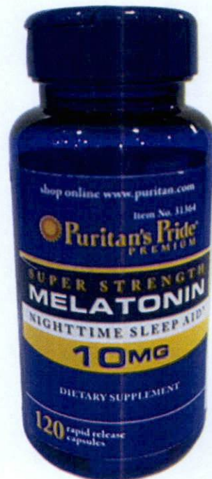
Figure 1. Unregistered PURITAN'S PRIDE PREMIUM Super Strength Melatonin Dietary Supplement

The Food and Drug Administration (FDA) warns all healthcare professionals and the general public NOT TO PURCHASE AND CONSUME the following unregistered food supplement and food products: