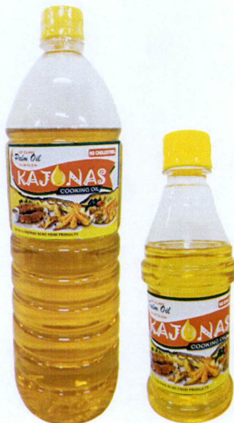
Figure 5. Unregistered KAJONAS Cooking Oil 1st Class Palm Oil Palm Olein