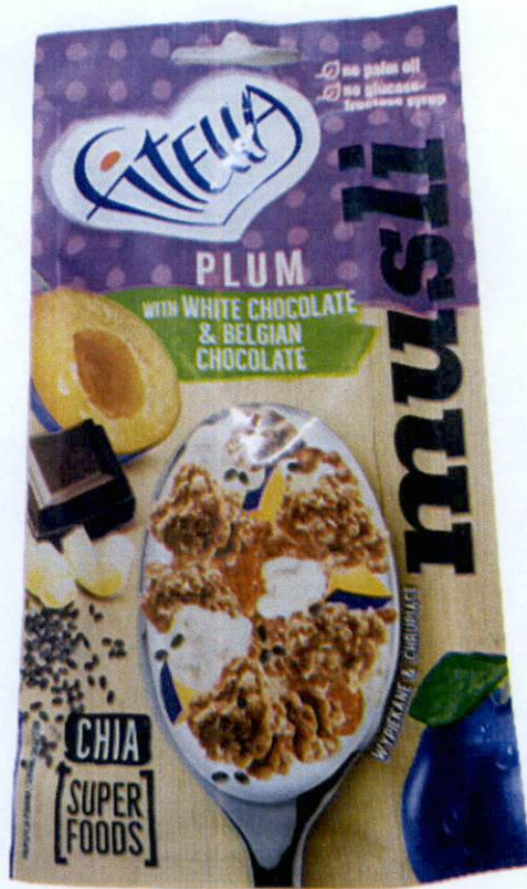
Figure 4. Unregistered FITELLA MUSLI Plum with White Chocolate & Belgian Chocolate