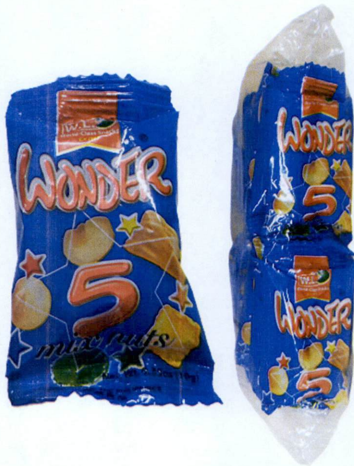
Figure 3. Unregistered W.L. WONDER 5 Mix Nuts