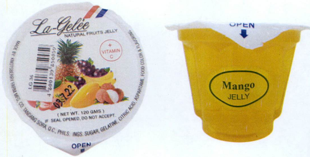
Figure 2. Unregistered LA-GELEÉ Mango Jelly Natural Fruits Jelly