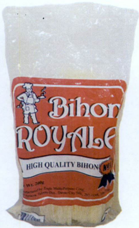
Figure 2. Unregistered BIHON ROYALE Bihon