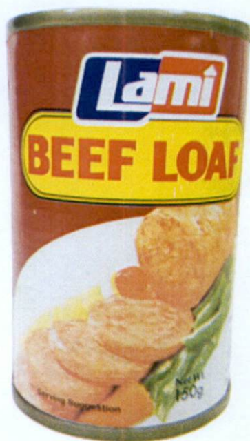
Figure 4. Unregistered LAMI Beef Loaf