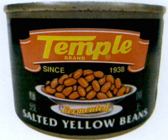
Figure 3. Unregistered TEMPLE Fermented Salted Yellow Beans