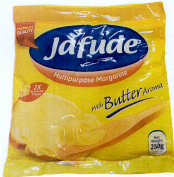
Figure 1. Unregistered JAFUDE Multipurpose Margarine with Butter Aroma

The Food and Drug Administration (FDA) warns all healthcare professionals and the general public NOT TO PURCHASE AND CONSUME the following unregistered food products: