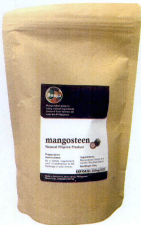
Figure 3. Unregistered BUNGA Mangosteen