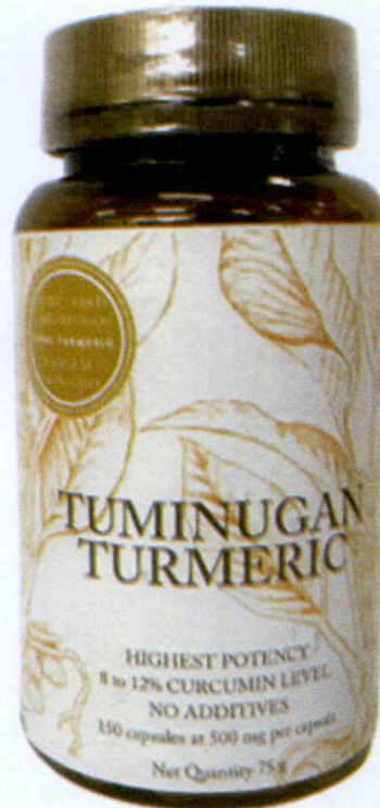
Figure 4. Unregistered TUMINUGAN Turmeric Food Supplement