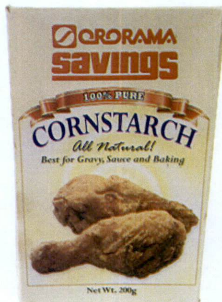
Figure 1. Unregistered ORORAMA SAVINGS Cornstarch All Natural

The Food and Drug Administration (FDA) warns all healthcare professionals and the general public NOT TO PURCHASE AND CONSUME the following unregistered food products and food supplement: