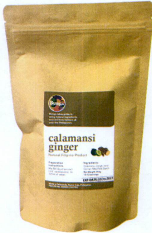
Figure 2. Unregistered BUNGA Calamansi Ginger