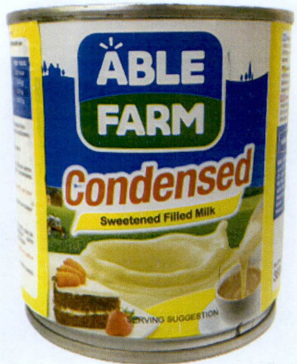
Figure 3. Unregistered ABLE FARM Condensed Sweetened Filled Milk