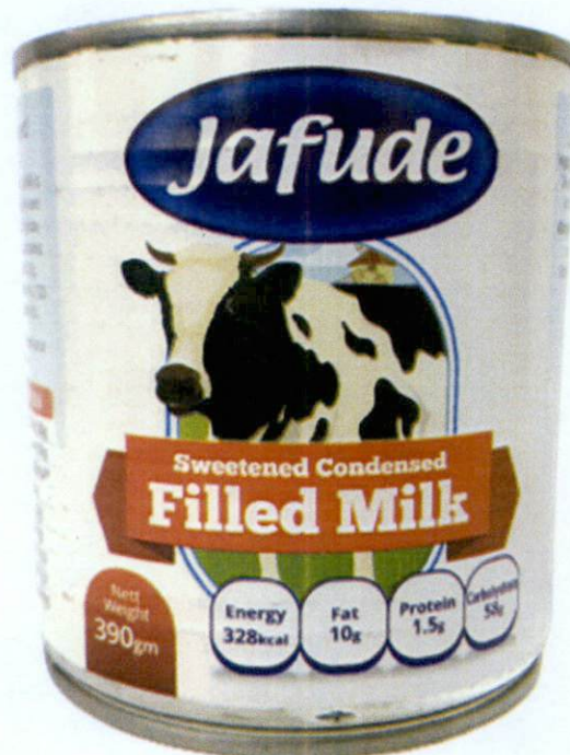
Figure 1. Unregistered JAFUDE Sweetened Condensed Filled Milk

The Food and Drug Administration (FDA) warns all healthcare professionals and the general public NOT TO PURCHASE AND CONSUME the following unregistered food products: