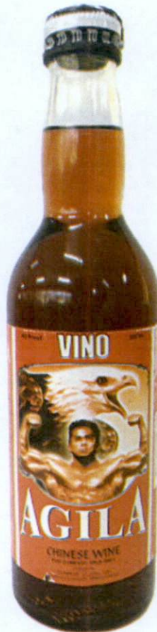
Figure 4. Unregistered VINO AGILA Chinese Wine