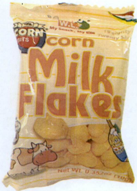
Figure 2. Unregistered W.L. Corn Milk Flakes