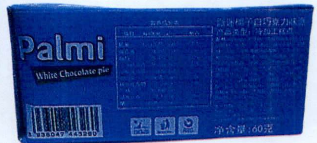
Figure 3. Unregistered PALMI White Chocolate Pie Coconut Milk (In Foreign Language)