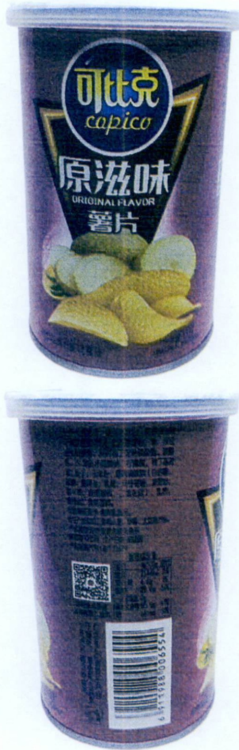
Figure 4. Unregistered COPICO Original Flavor (In Foreign Language)