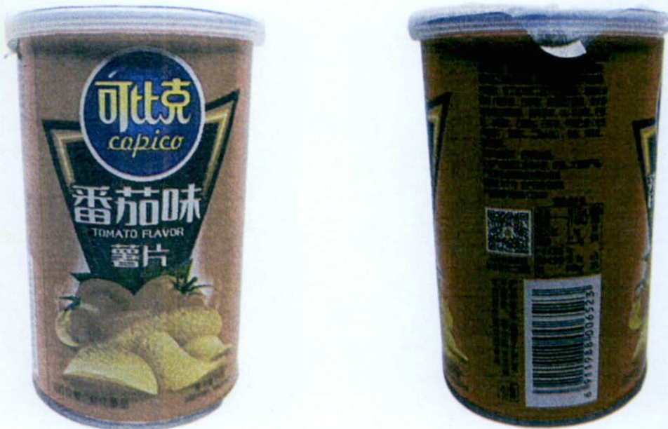
Figure 1. Unregistered COPICO Tomato Flavor (In Foreign Language)

The Food and Drug Administration (FDA) warns all healthcare professionals and the general public NOT TO PURCHASE AND CONSUME the following unregistered food products: