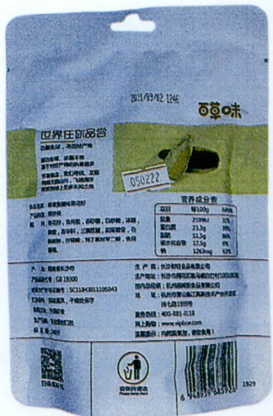
Figure 2. Unregistered Sunflower Seeds in White and Yellow Stand-Up Pouch (In Foreign Language)