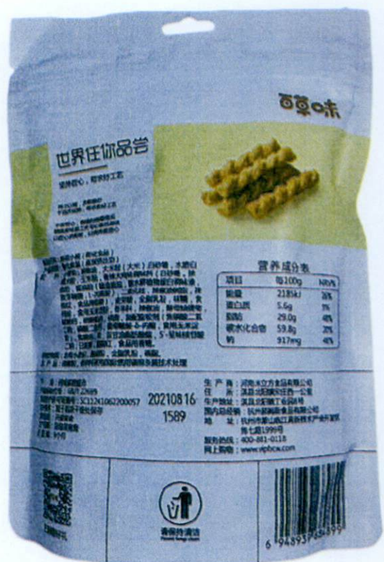
Figure 3. Unregistered Crispy Twist in White and Yellow Stand-Up Pouch (In Foreign Language)