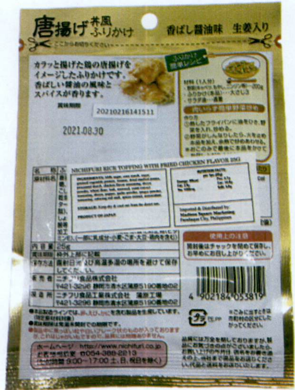
Figure 4. Unregistered NICHIFURI Rice Topping with Fried Chicken Flavor