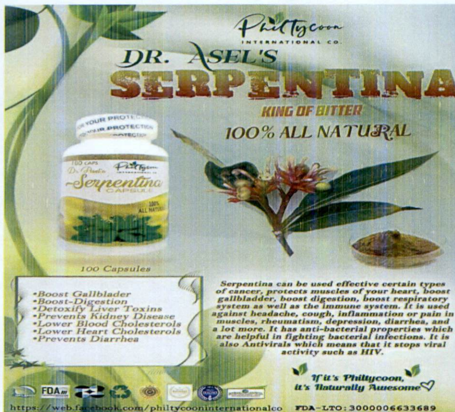
Figure 3. Unregistered DR. ASEL'S Serpentina