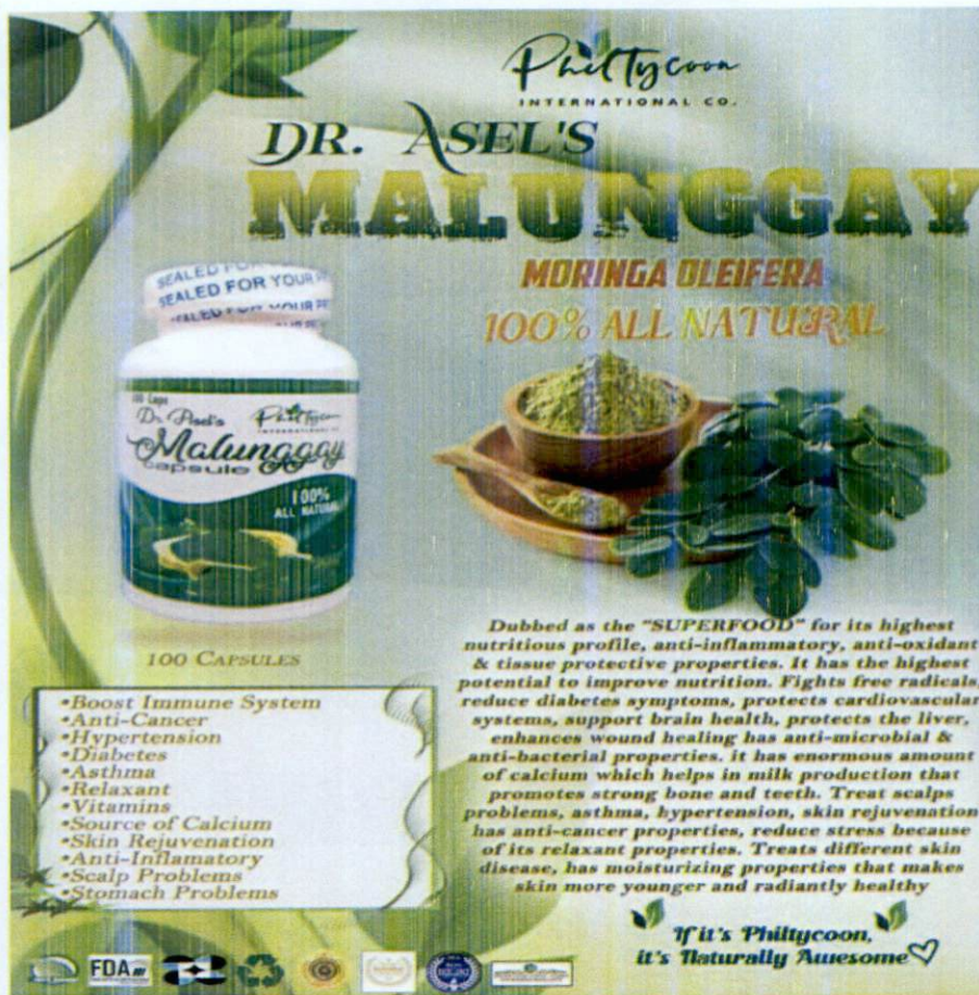
Figure 2. Unregistered DR. ASEL'S Malunggay Capsule