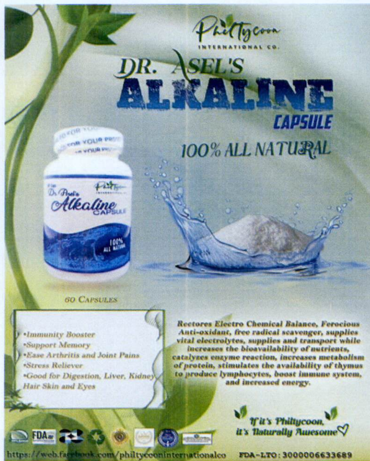
Figure 1. Unregistered DR. ASEL'S Alkaline Capsule

The Food and Drug Administration (FDA) warns all healthcare professionals and the general public NOT TO PURCHASE AND CONSUME the following unregistered food supplements: