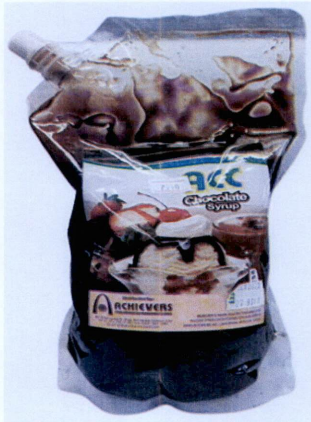
Figure 3. Unregistered ACC Chocolate Syrup