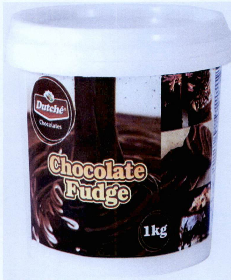
Figure 1. Unregistered DUTCHE Chocolates Chocolate Fudge, 1kg

The Food and Drug Administration (FDA) warns all healthcare professionals and the general public NOT TO PURCHASE AND CONSUME the following unregistered food products: