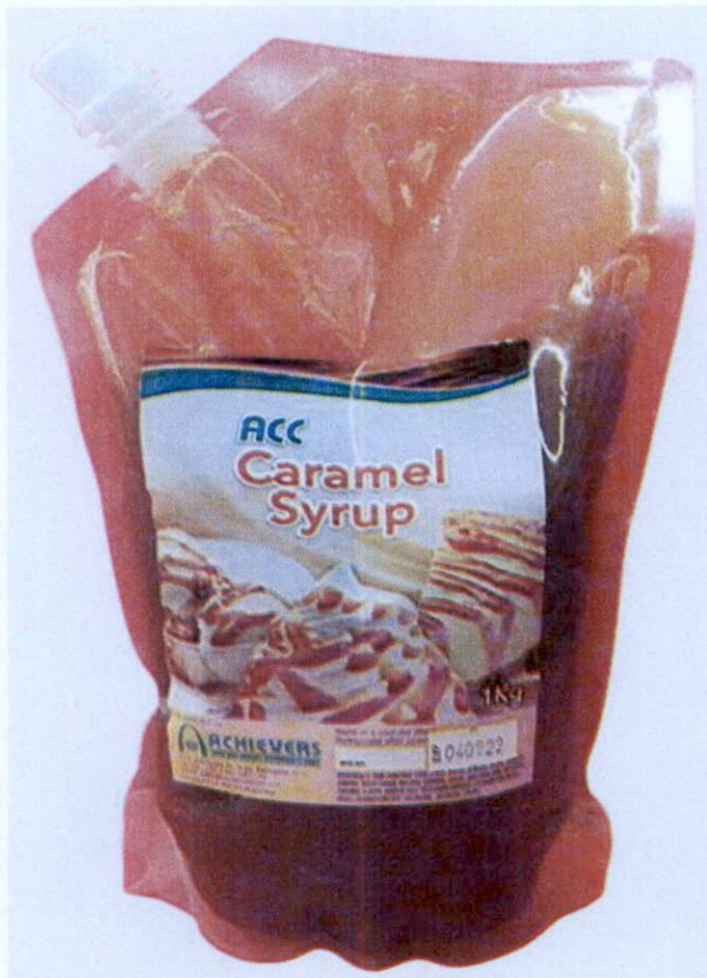
Figure 2. Unregistered ACC Caramel Syrup, 1kg.