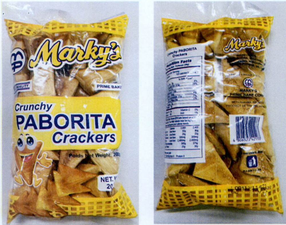
Figure 2. Unregistered MARKY'S Crunchy Paborita Crackers