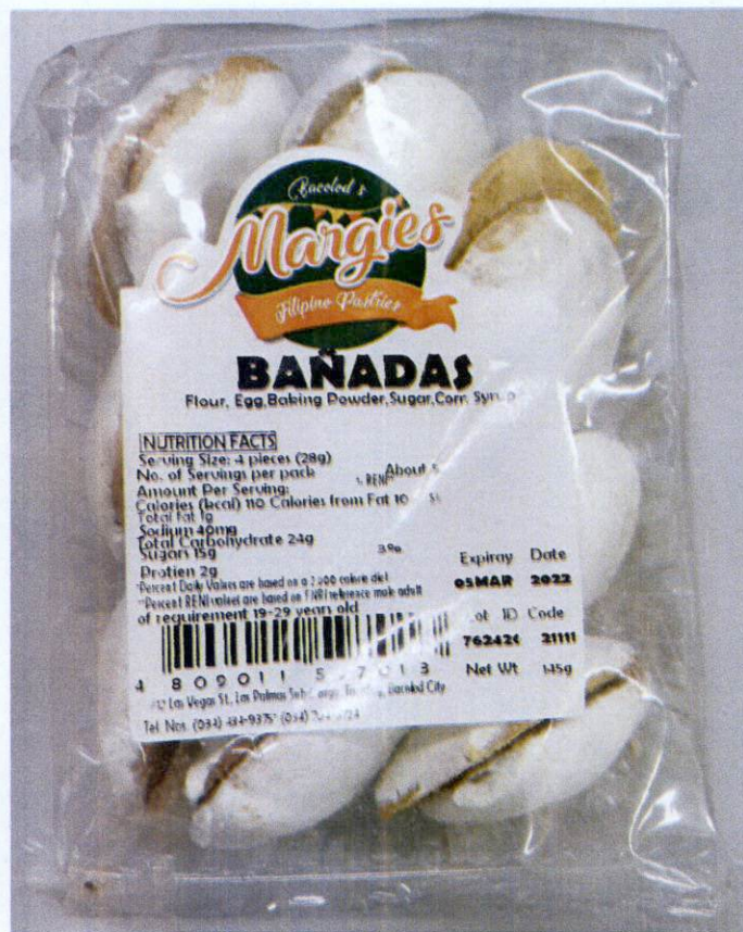
Figure 1. Unregistered BACOLOD'S MARGIES FILIPINO PASTRIES Bañadas

The Food and Drug Administration (FDA) warns all healthcare professionals and the general public NOT TO PURCHASE AND CONSUME the following unregistered food products: