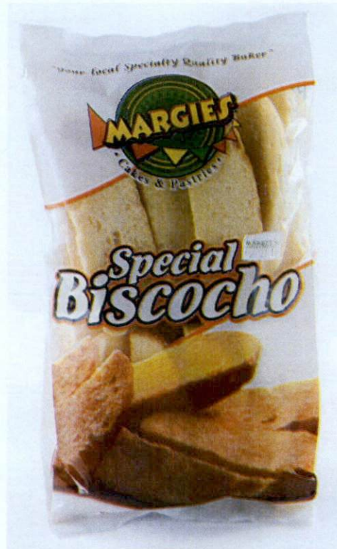
Figure 3. Unregistered BACOLOD'S MARGIES FILIPINO PASTRIES Special Biscocho