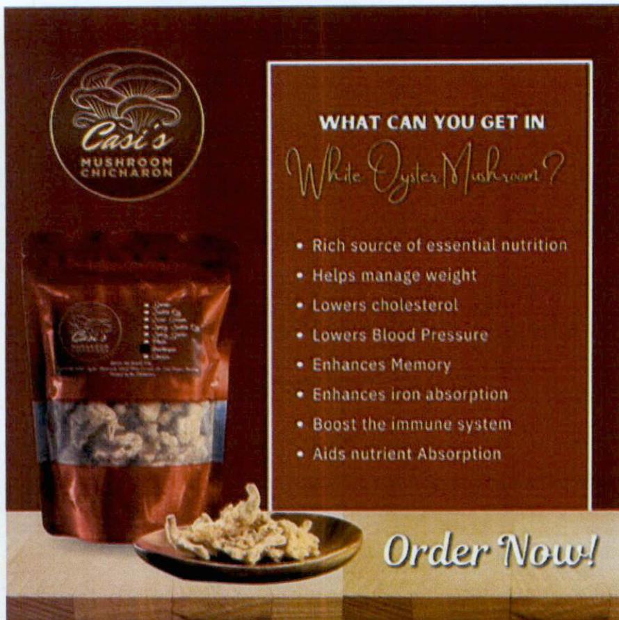
Figure 2. Unregistered CASI'S Mushroom Chicharon