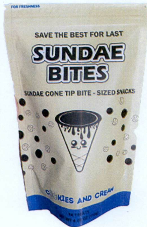
Figure 3. Unregistered SUNDAE BITES Cookies and Cream