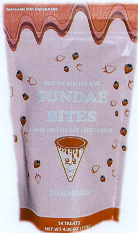
Figure 4. Unregistered SUNDAE BITES Strawberry

The FDA verified through online monitoring or post-marketing surveillance that the abovementioned food supplement and food products are not registered and no corresponding Certificates of Product Registration (CPR) have been issued. Pursuant to the Republic Act No. 9711, otherwise known as the “Food and Drug Administration Act of 2009”, the manufacture, importation, exportation, sale, offering for sale, distribution, transfer, non-consumer use, promotion, advertising or sponsorship of health products without the proper authorization is prohibited.