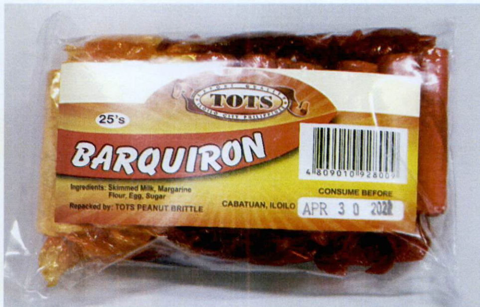
Figure 4. Unregistered TOTS Barquiron