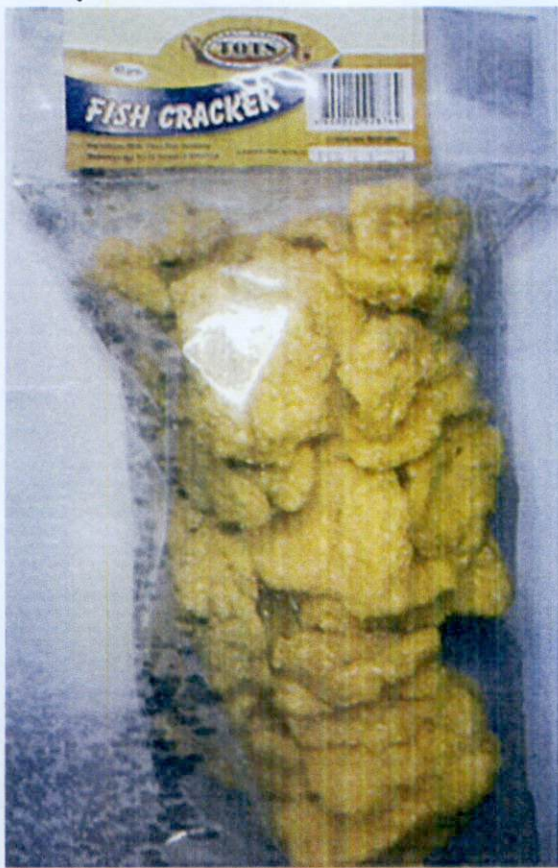
Figure 2. Unregistered TOTS Fish Cracker