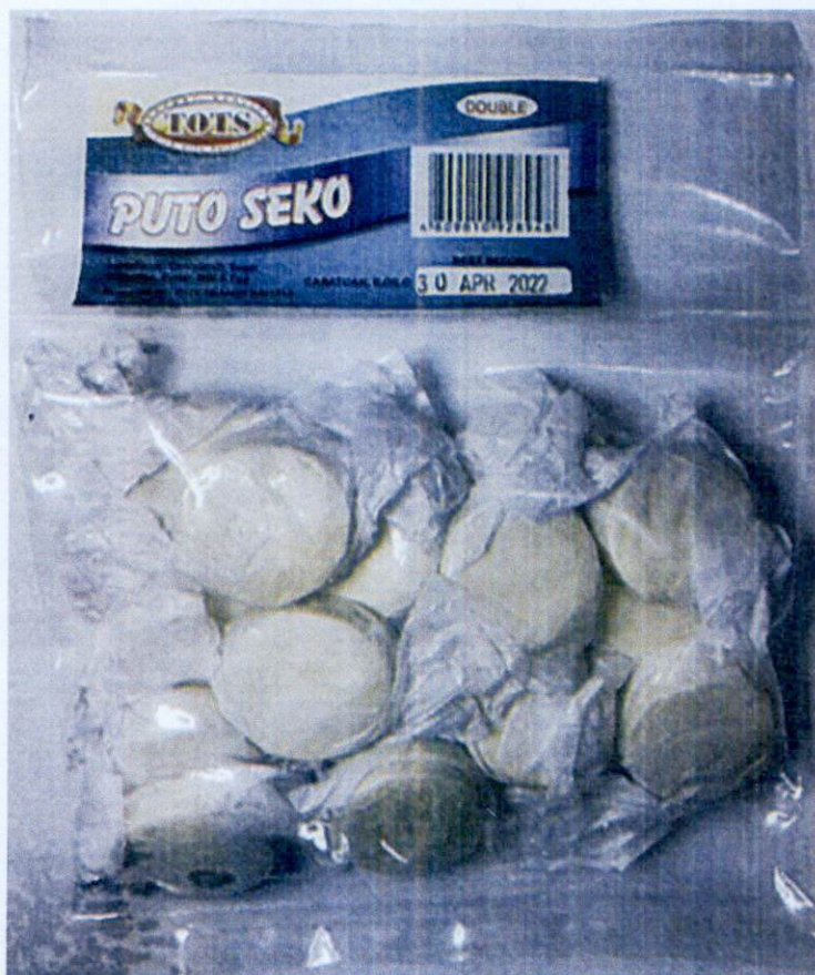
Figure 1. Unregistered TOTS Puto Seko Double

The Food and Drug Administration (FDA) warns all healthcare professionals and the general public NOT TO PURCHASE AND CONSUME the following unregistered food products: