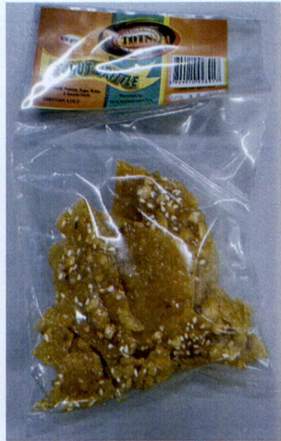
Figure 3. Unregistered TOTS Peanut Brittle