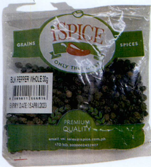
Figure 2. Unregistered ISPIICE Blk Pepper Whole, 30 g