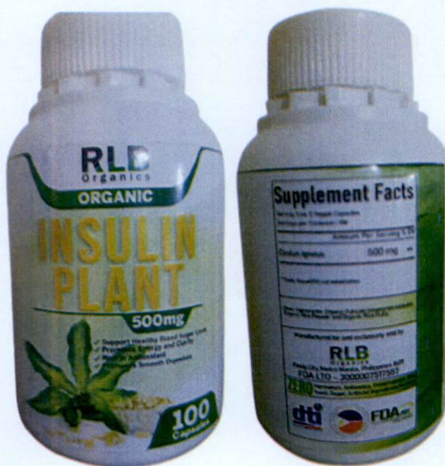
Figure 1. Unregistered RLD ORGANICS Organic Insulin Plant 500 mg, 100 capsules

The Food and Drug Administration (FDA) warns all healthcare professionals and the general public NOT TO PURCHASE AND CONSUME the following unregistered food supplement products: