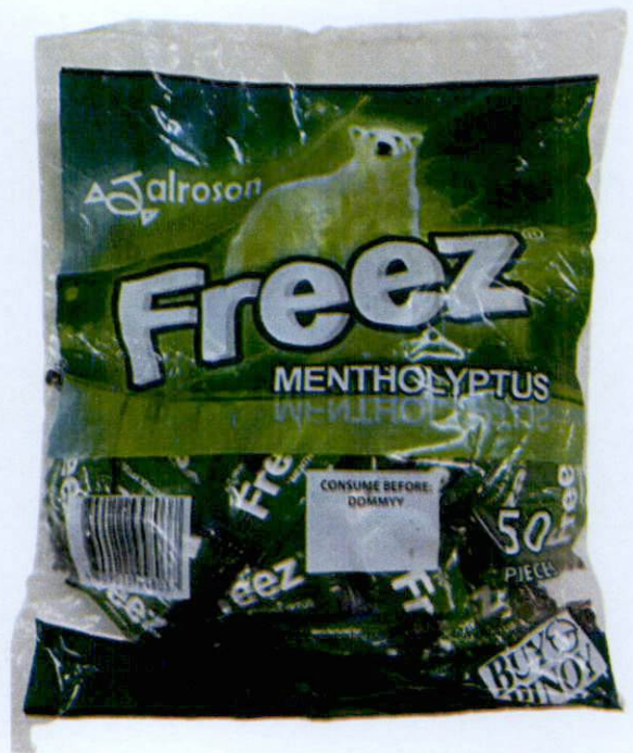
Figure 3. Unregistered JALROSON Freez Mentholiptus, 50 pcs