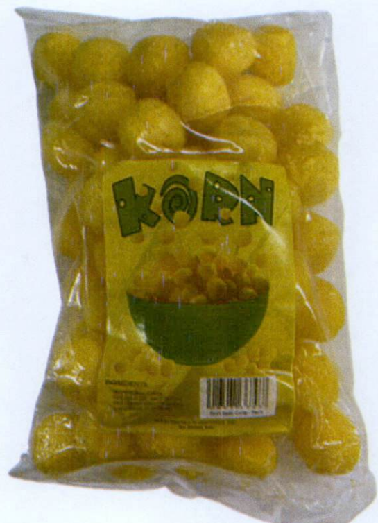
Figure 5. Unregistered (UNBRANDED) Korn