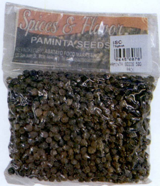
Figure 4. Unregistered SPICES & FLAVOR Paminta Seeds, 50 g