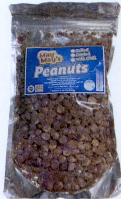
Figure 5. MAY MAY'S Peanut