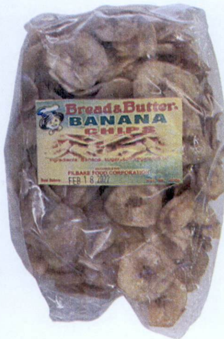
Figure 4. Unregistered BREAD & BUTTER Banana Chips, 400 g