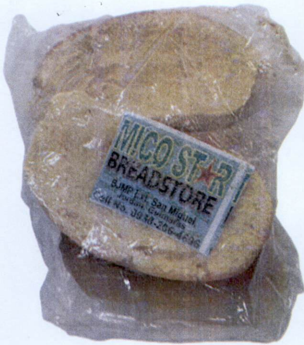
Figure 2. Unregistered MICO STAR BREADSTORE Kamya