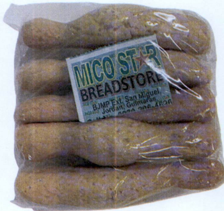
Figure 1. Unregistered MICO STAR BREADSTORE Sambag

The Food and Drug Administration (FDA) warns all healthcare professionals and the general public NOT TO PURCHASE AND CONSUME the following unregistered food products: