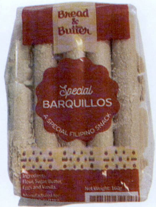
Figure 3. Unregistered BREAD & BUTTER Special Barquillos, 160 g