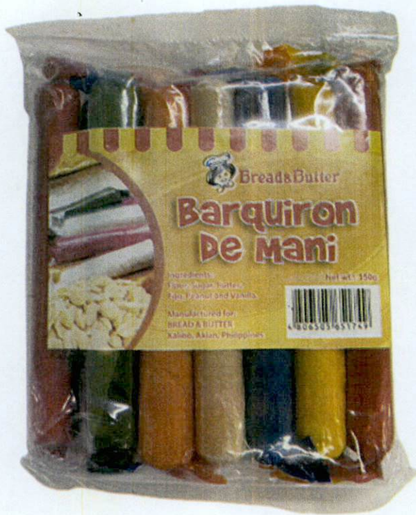
Figure 2. Unregistered BREAD & BUTTER Barquiron de Mani, 150 g