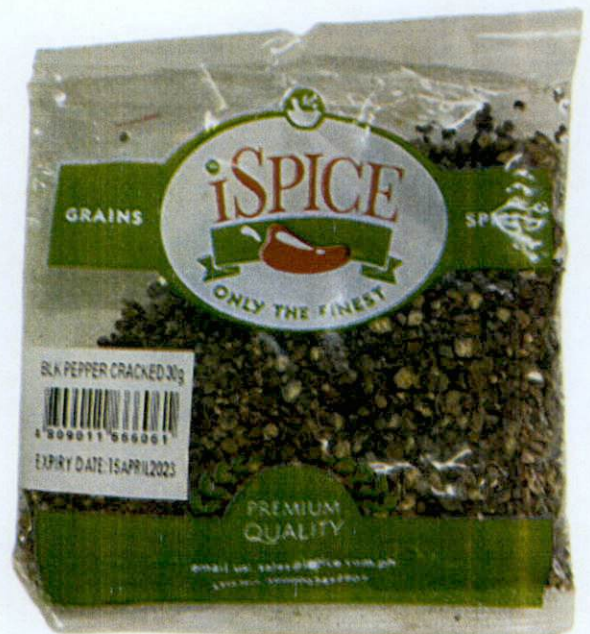
Figure 5. Unregistered ISPICE Blk Pepper Cracked, 30 g