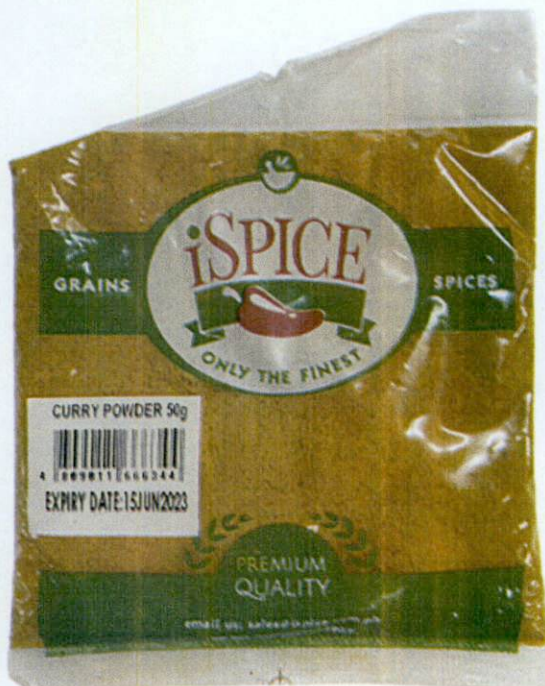
Figure 4. Unregistered ISPICE Curry Powder, 50 g