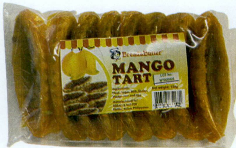
Figure 5. Unregistered BREAD & BUTTER Mango Tart, 150 g

The Food and Drug Administration (FDA) warns all healthcare professionals and the general public NOT TO PURCHASE AND CONSUME the following unregistered food products: