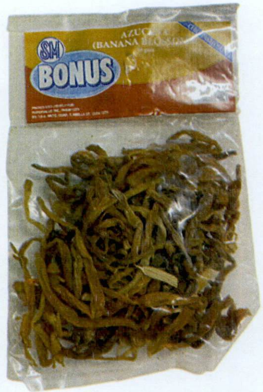
Figure 3. Unregistered SM BONUS Azucena (Banana Blossoms), 50 g