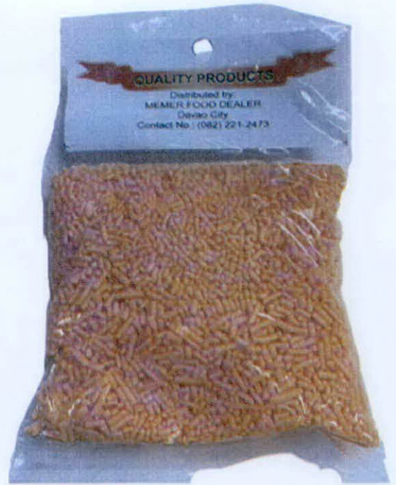
Figure 3. Unregistered BAKE KING ESSENTIALS Cake Topper Vermicelli Orange, 50 g