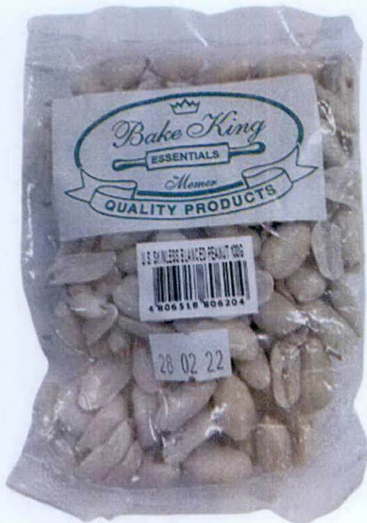
Figure 4. Unregistered BAKE KING ESSENTIALS U.S. Skinless Blanched Peanut, 100 g