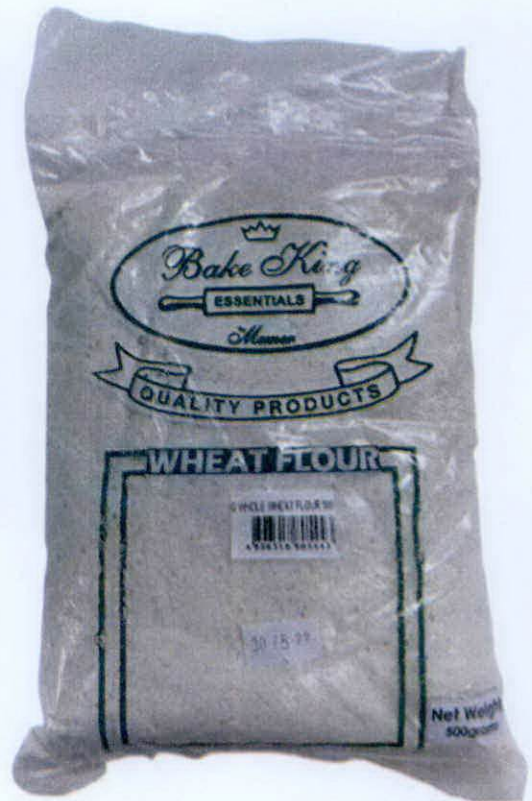
Figure 5. BAKE KING Wheat Flour, 500 g