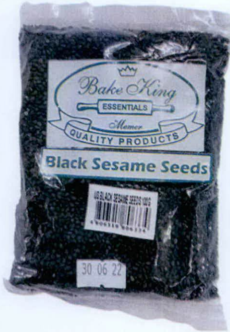
Figure 2. Unregistered BAKE KING ESSENTIALS Black Sesame Seeds, 100 g