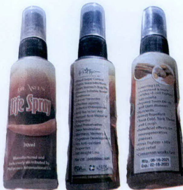
Figure 1. Unregistered DR. ASELS Life Spray, 30 mL

The Food and Drug Administration (FDA) warns all healthcare professionals and the general public NOT TO PURCHASE AND CONSUME the following unregistered food Supplement and food Products: