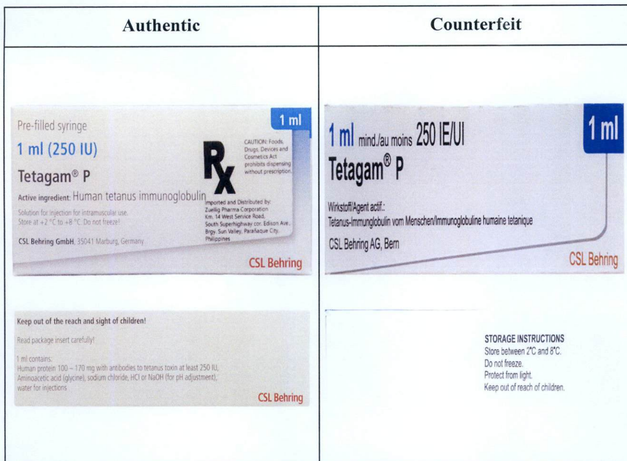
Figure 2. Comparison between the Authentic and Verified Counterfeit Human Tetanus Immunoglobulin Tetagam® P 1 ml (250 IU) Solution for Injection (Lot No. 59867492L)

The FDA together with the Marketing Authorization Holder (MAH), Zuellig Pharma Corporation, have verified that the above-mentioned sample drug product is counterfeit. The comparison of the collected counterfeit drug product and the distinguishing feature of the authentic are as follows: