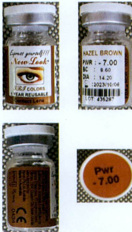
Figure 2. New Look TRJ Colors 1 Year Reusable Hazel Brown with Expired Certificate of Product Registration