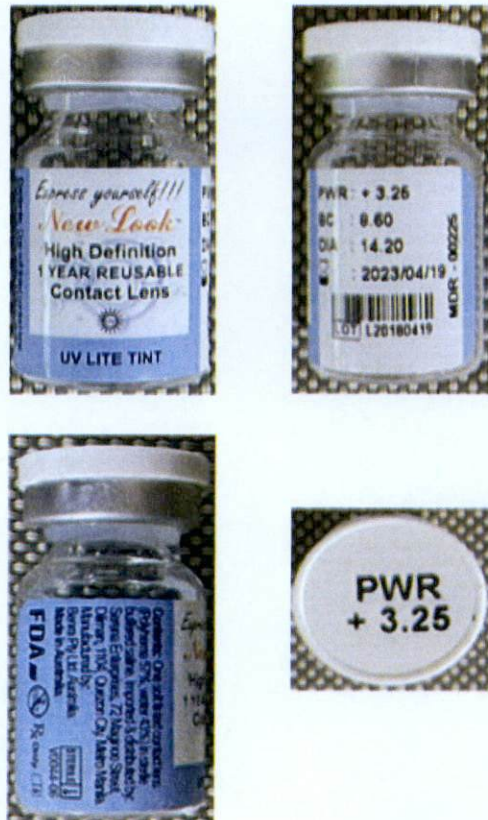
Figure 3. New Look High Definition 1 year reusable Contact Lens with Expired Certificate of Product Registration