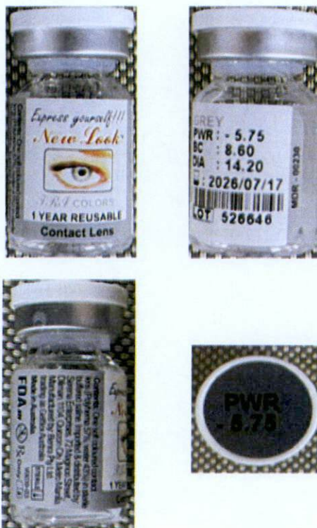
Figure 1. New Look TRJ Colors 1 Year Reusable Grey with Expired Certificate of Product Registration

The Food and Drug Administration (FDA) warns all healthcare professionals and the general public NOT TO PURCHASE AND USE the medical device products with expired Certificate of Product Registration: