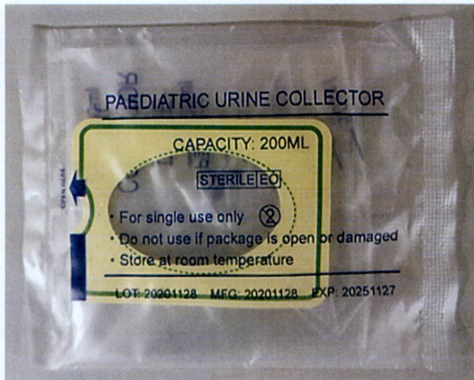
Figure 1. Unnotified Paediatric Urine Collector – 200ML

The Food and Drug Administration (FDA) warns all healthcare professionals and the general public NOT TO PURCHASE AND USE the unnotified medical device product: