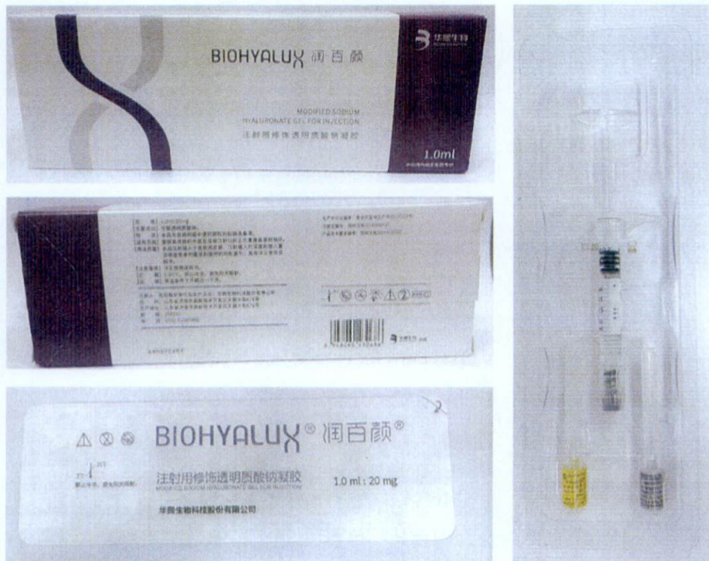
Figure 1. Unregistered Biohyalux Modified Sodium Hyaluronate Gel for Injection

The Food and Drug Administration (FDA) warns all healthcare professionals and the general public NOT TO PURCHASE AND USE the unregistered medical device products: