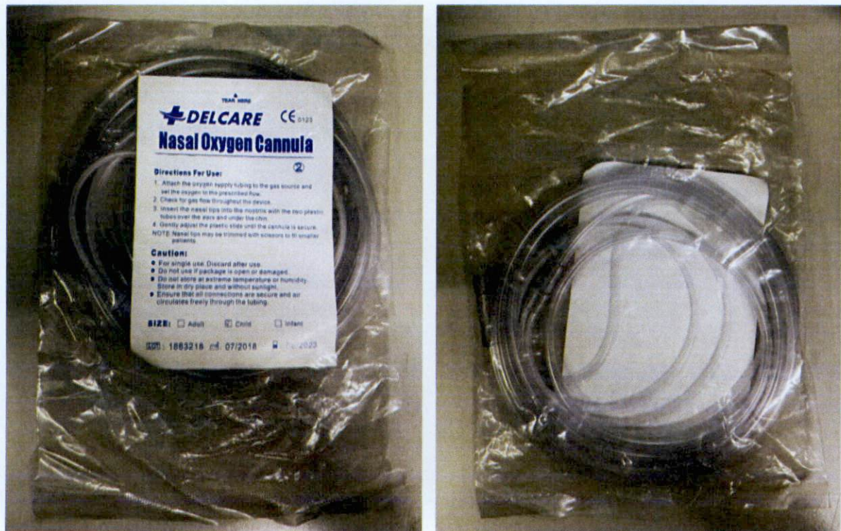
Figure 1. Unregistered Delcare Nasal Oxygen Cannula

The Food and Drug Administration (FDA) warns all healthcare professionals and the general public NOT TO PURCHASE AND USE the unregistered medical device product: