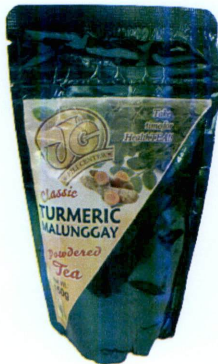
Figure 1. Unregistered JC PILI CENTER Classic Turmeric Malunggay Powdered Tea

The Food and Drug Administration (FDA) warns all healthcare professionals and the general public NOT TO PURCHASE AND CONSUME the unregistered food product: