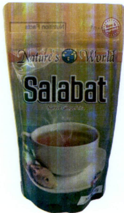
Figure 1. Unregistered NATURE'S WORLD Salabat Native Ginger Tea

The Food and Drug Administration (FDA) warns all healthcare professionals and the general public NOT TO PURCHASE AND CONSUME the unregistered food product: