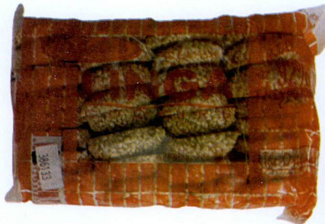
Figure 1. Unregistered NAVALES Linga Cookies

The Food and Drug Administration (FDA) warns all healthcare professionals and the general public NOT TO PURCHASE AND CONSUME the unregistered food product: