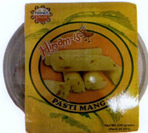
Figure 1. Unregistered HINAM-IS Pasti Manga

The Food and Drug Administration (FDA) warns all healthcare professionals and the general public NOT TO PURCHASE AND CONSUME the unregistered food product: