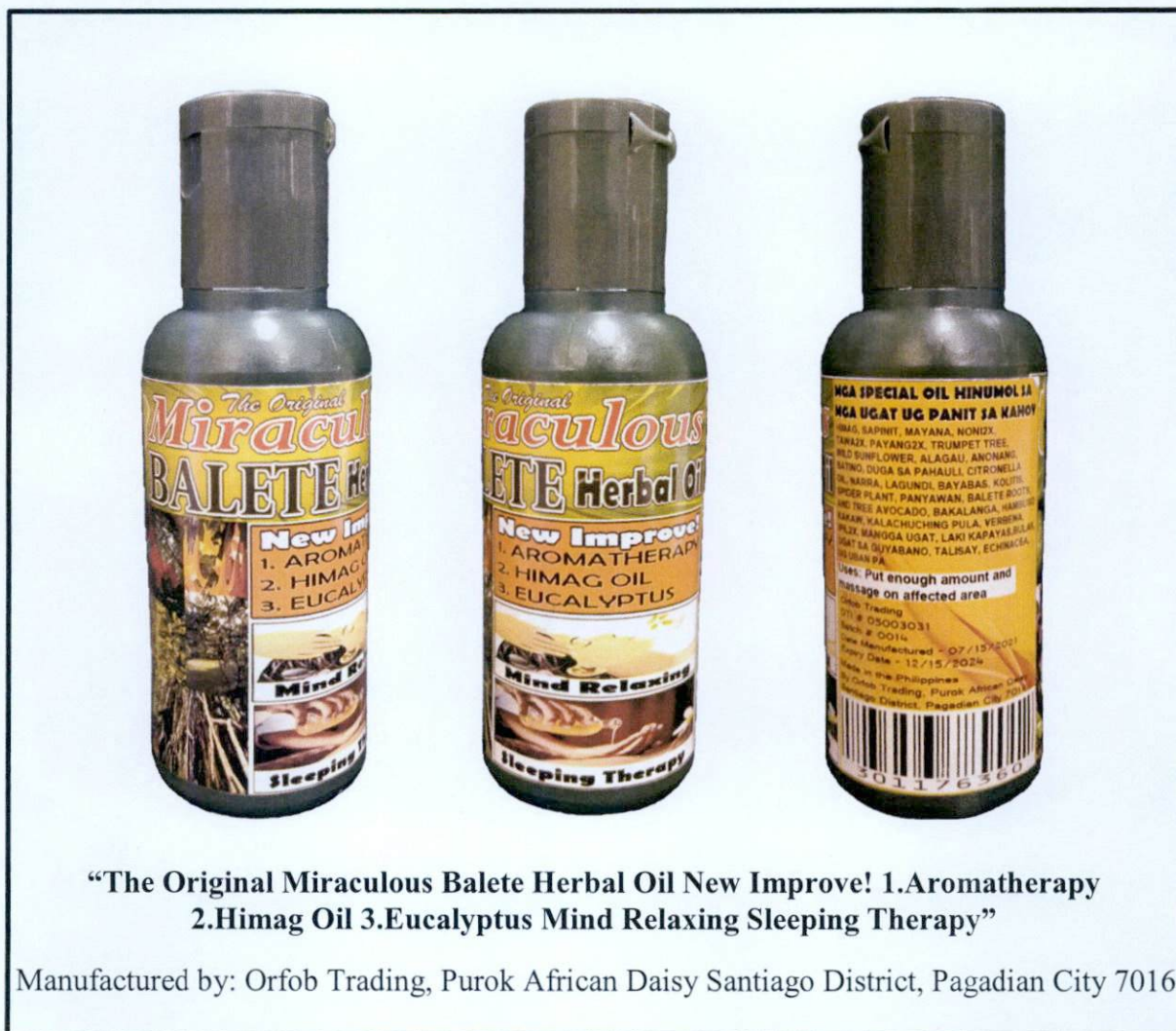
Figure 1: Unregistered drug product

The Food and Drug Administration (FDA) advises the public against the purchase and use of the unregistered drug product: