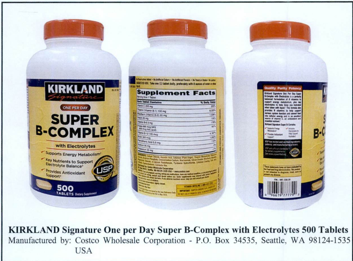
Figure 3. Unregistered drug product