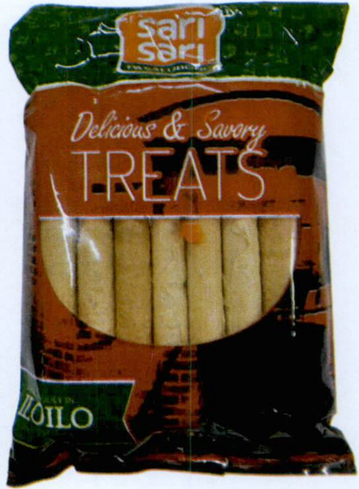
Figure 3. Unregistered SARI SARI PASALUBONG Barquillos Mini