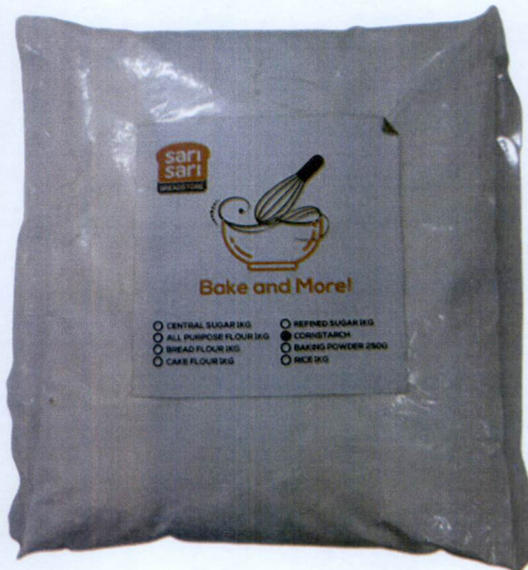
Figure 1. Unregistered SARI SARI BREADSTORE Cornstarch

The Food and Drug Administration (FDA) warns all healthcare professionals and the general public NOT TO PURCHASE AND CONSUME the following unregistered food products: