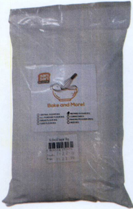
Figure 2. Unregistered SARI SARI BREADSTORE Refined Sugar, Net Wt. 1 kg