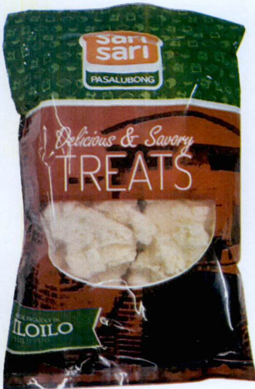
Figure 4. Unregistered SARI SARI PASALUBONG Meringue Small