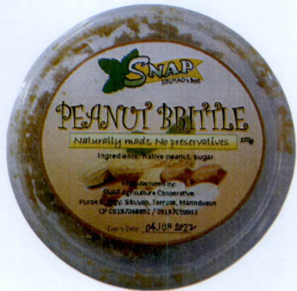
Figure 5. Unregistered SNAP SIBUYAO'S BEST Peanut Brittle, Net Wt. 150g