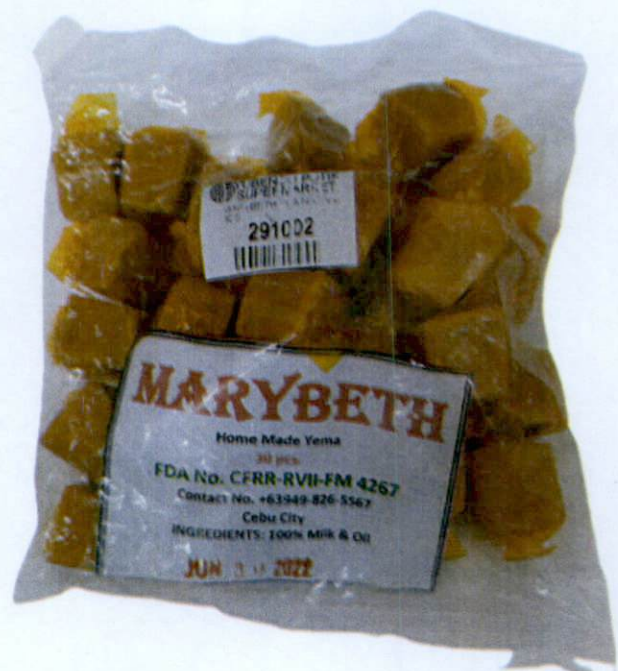
Figure 5. Unregistered MARYBETH Home Made Yema, Net Wt. 30 pcs