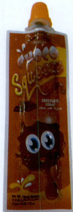
Figure 3. Unregistered COCOALAND Choco Squeeze Chocolate, Net Wt. 12g