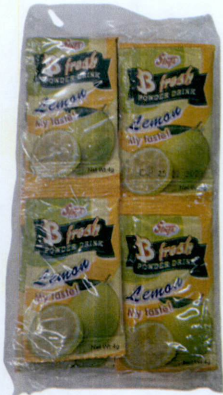
Figure 2. Unregistered SINTA B Fresh Powder Drink Lemon, Net Wt. 24 pcs x 4g= 96g