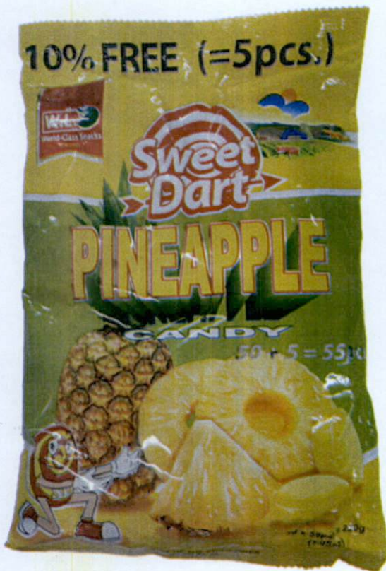
Figure 4. Unregistered WL Sweet Dart Pineapple Candy, Net Wt. 55pcs x 4g= 220g