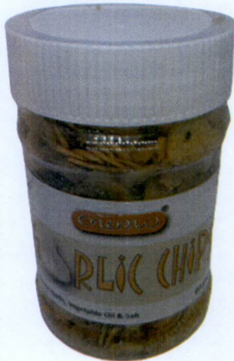
Figure 1. Unregistered MEMO Garlic Chips, Net Wt. 60 g

The Food and Drug Administration (FDA) warns all healthcare professionals and the general public NOT TO PURCHASE AND CONSUME the following unregistered food products: