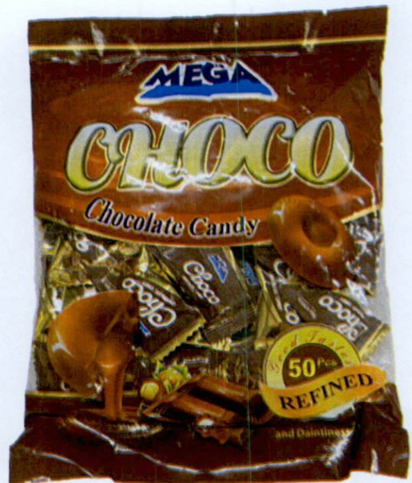
Figure 3. Unregistered MEGA CHOCO Chocolate Candy, Net Wt. 50 pcs