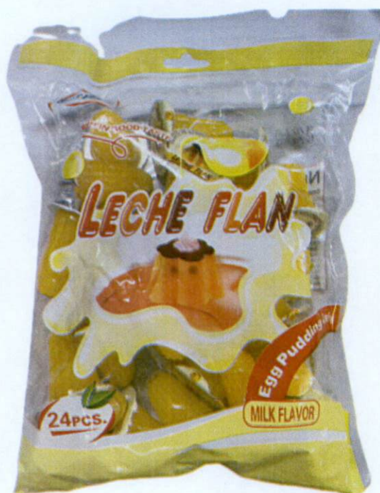
Figure 1. Unregistered HARVEY Leche Flan – Egg Pudding Jelly Milk Flavor, Net Wt. 24 pcs

The Food and Drug Administration (FDA) warns all healthcare professionals and the general public NOT TO PURCHASE AND CONSUME the following unregistered food products: