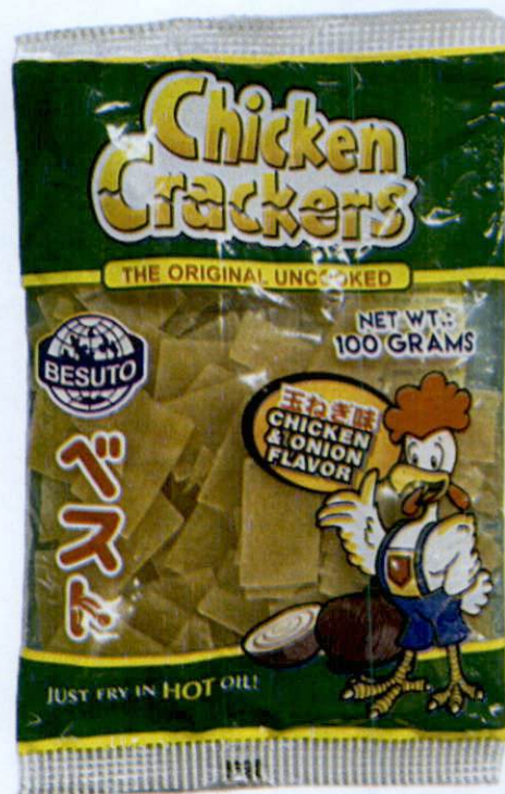
Figure 5. Unregistered BESUTO Chicken Crackers The Original Uncooked – Chicken & Onion Flavor, Net Wt. 100g