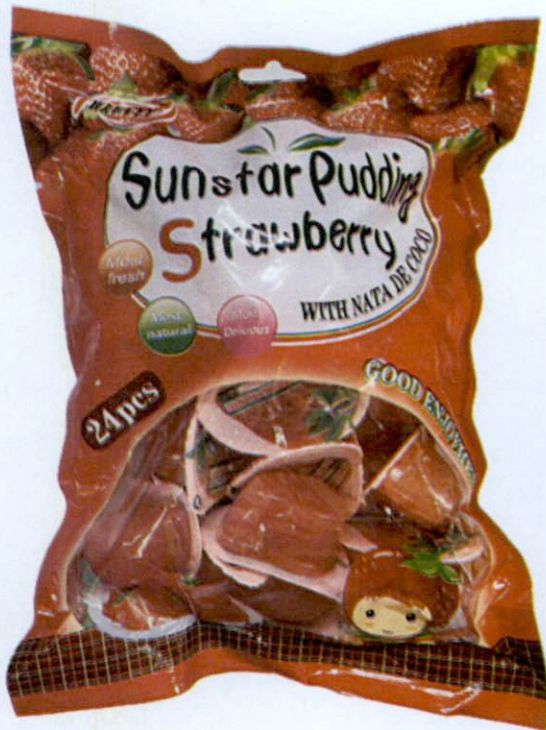
Figure 2. Unregistered HARVEY Sunstar Pudding Strawberry with Nata de Coco, Net Wt. 420g