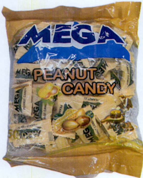
Figure 4. Unregistered MEGA Peanut Candy