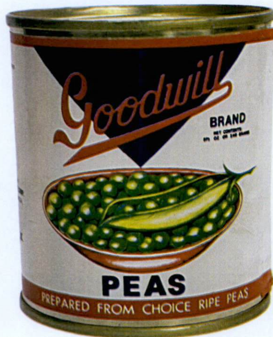
Figure 1. Unregistered GOODWILL BRAND Peas Prepared from Choice Ripe Peas, Net Wt. 240g

The Food and Drug Administration (FDA) warns all healthcare professionals and the general public NOT TO PURCHASE AND CONSUME the following unregistered food products: