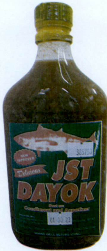
Figure 2. Unregistered JST Dayok