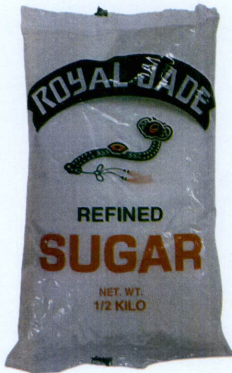
Figure 3. Unregistered ROYAL JADE Refined Sugar, Net Wt. 1/2 kg