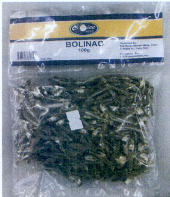
Figure 1. Unregistered CHOICE BY NCCC Bolinao

The Food and Drug Administration (FDA) warns all healthcare professionals and the general public NOT TO PURCHASE AND CONSUME the unregistered food product: