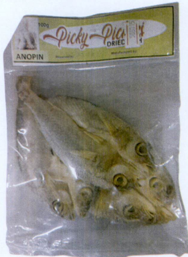
Figure 3. Unregistered PICKY PICKER'S Dried Fish Anopin, Net Wt. 100g