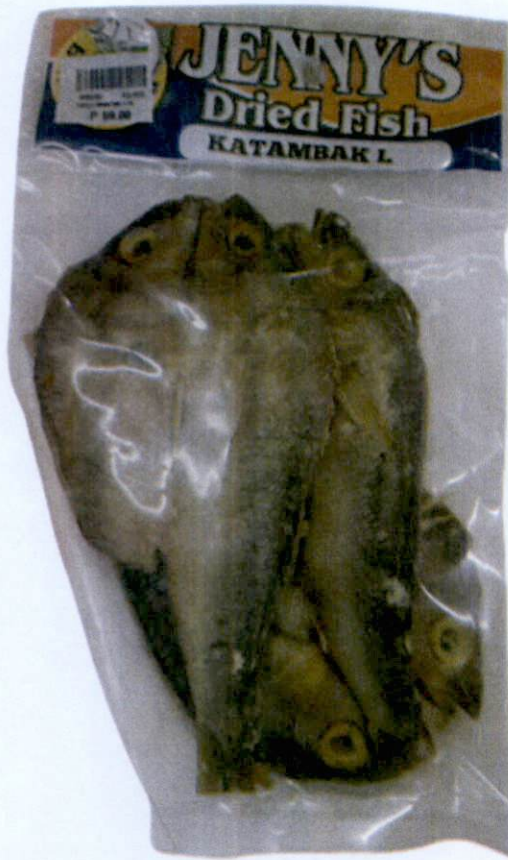
Figure 2. Unregistered JENNY'S Dried Fish Katambak L