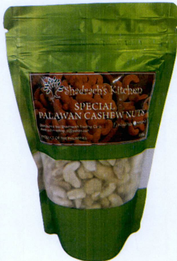
Figure 1. Unregistered SHADRACH'S KITCHEN Special Palawan Cashew Nuts - Roasted, Net Wt. 250g

The Food and Drug Administration (FDA) warns all healthcare professionals and the general public NOT TO PURCHASE AND CONSUME the following unregistered food products: