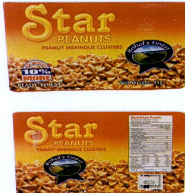
Figure 1. Unregistered STAR PEANUTS Peanut Meringue Clusters

The Food and Drug Administration (FDA) warns all healthcare professionals and the general public NOT TO PURCHASE AND CONSUME the unregistered food product: