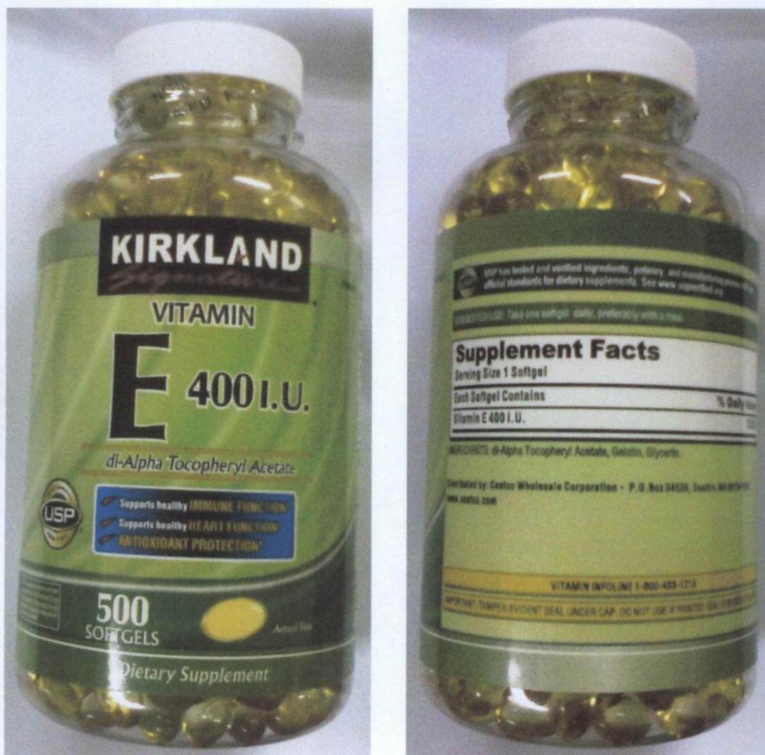
Figure 1. Image of Unregistered Drug Product

The Food and Drug Administration advises the public against the use of the unregistered drug product "KIRKLAND Signature Vitamin E 400 I.U. Softgels":