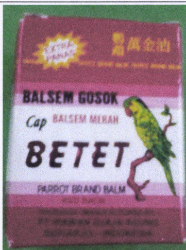
BALSEM GOSOK CAP BALSEM MERAH BETET 17.5 g BALM Manufactured by PT Irawan Djaja agung Sidoarjo - Indonesia

The Food and Drug Administration advises the public against the use of the following unregistered drug products: