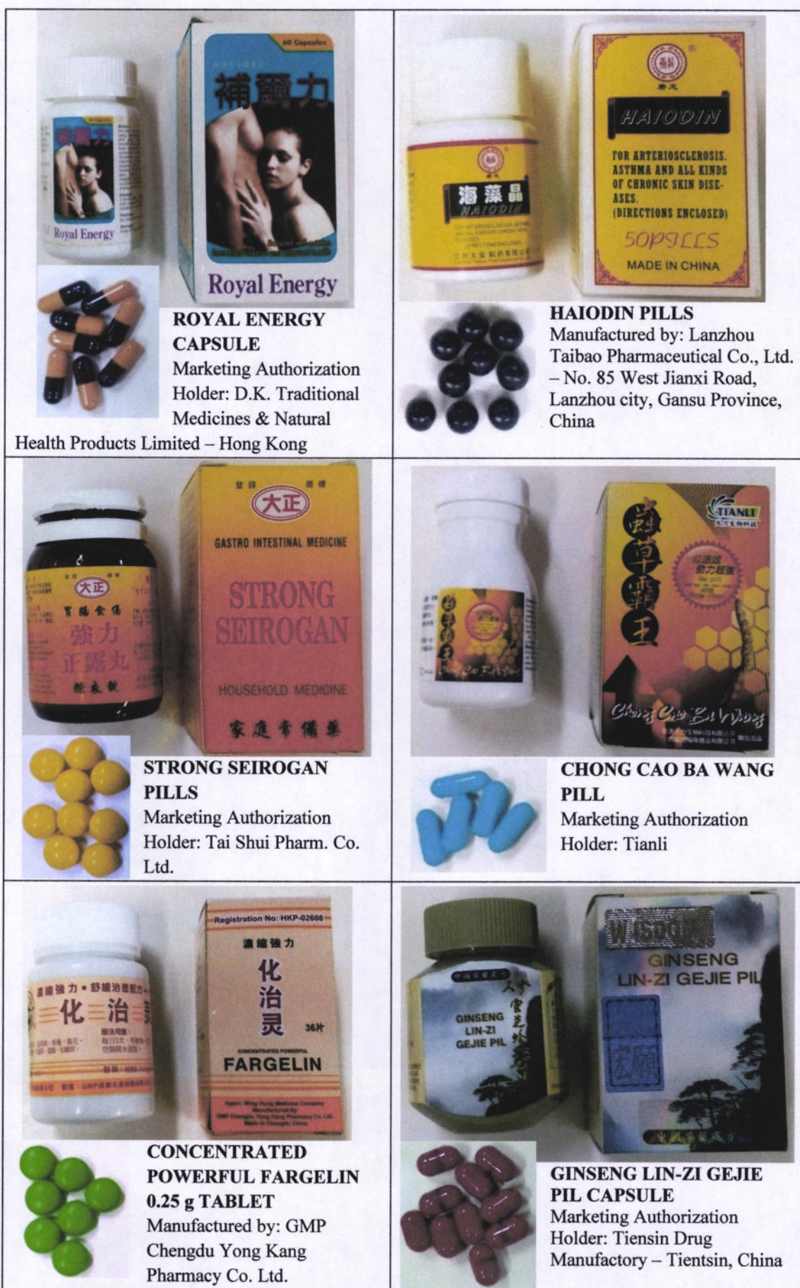
Table 1. Unregistered Drug Products